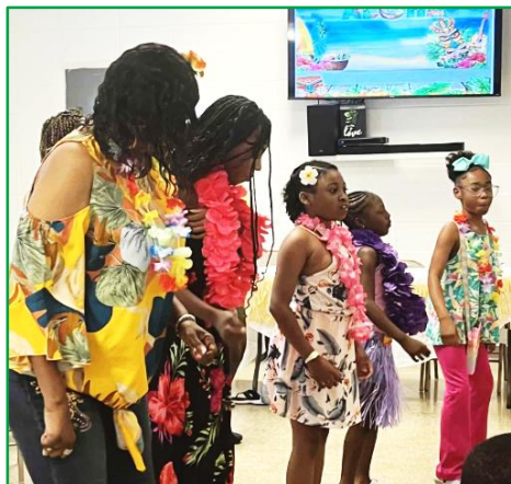
Children, parents, and staff are enjoying a dance.

On July 12, 2025, CSLC hosted its Third Community Luau Fundraiser, filling the air with fun and excitement! Activities included a talent show, dancing, delicious food, Hawaiian-