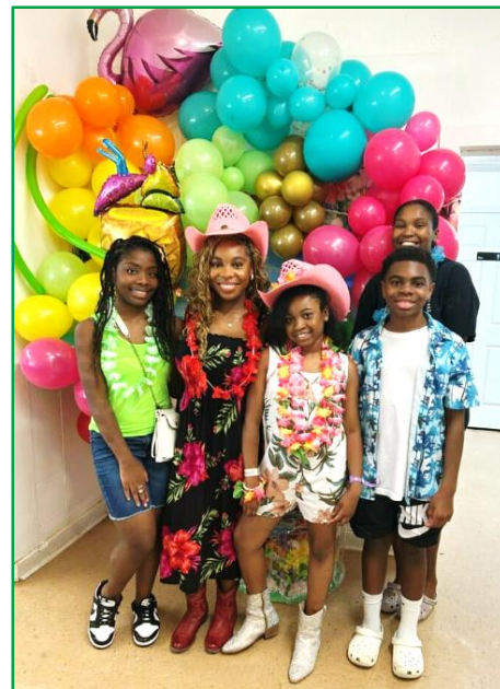
CSLC youth posing for a photo

Funds raised are used to help secure supplies for children in Holmes County, from Pre-K through high school. We are incredibly grateful to everyone who donated, organized